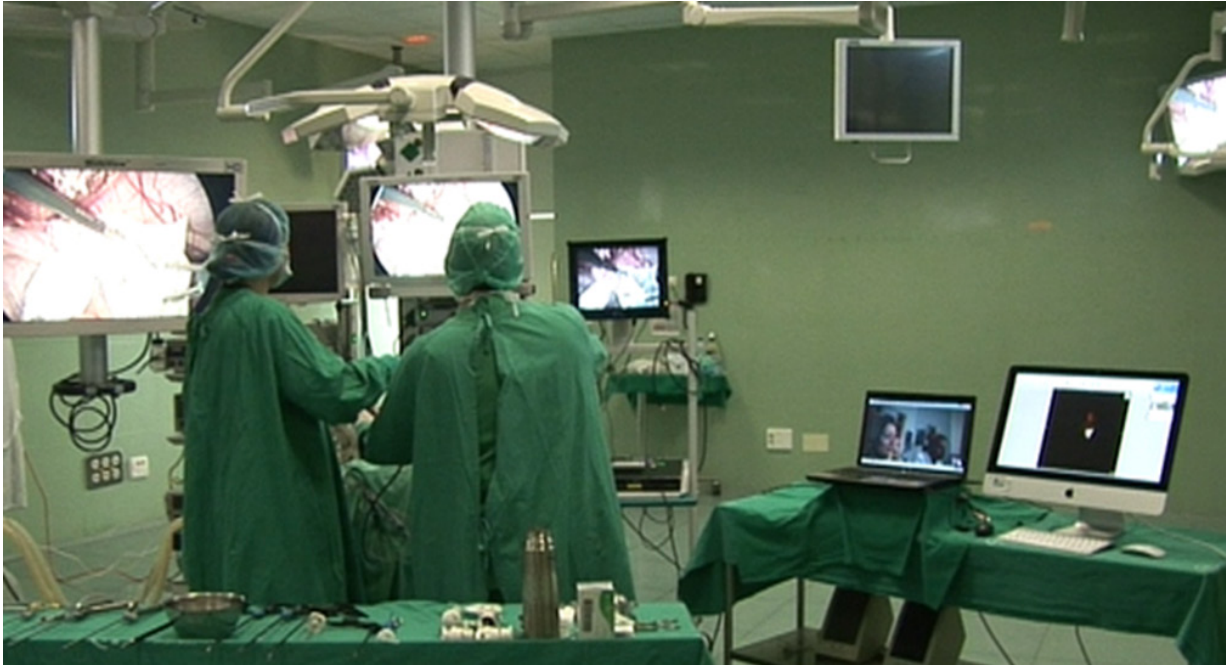
Figure 2 Set-up of the computers for telementoring in the operating room during the partial nephrectomy in an experimental porcine model. The surgeons performing the laparoscopy are seen on the left, with the set-up of the laptop and screen connected to the remote consulted surgeon on the right.

including Skype and TeamViewer, the main costs for this procedure are those of the TedCube.