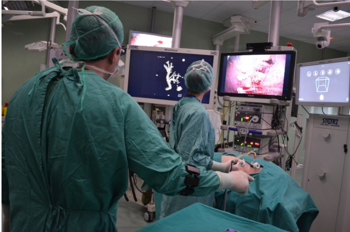
Figure 4 Interaction by the local surgeon, seen wearing the Myo gesture control armband for demonstration, with the preoperative images through wearable sensors during the laparoscopic surgery procedure.

video images, and interact with the available radiologic imaging.